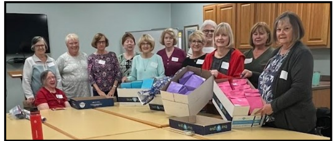
Susanna Wesley Women in Mission made four birthday boxes for Bethany House Shelter at their October meeting.

ADVENT STUDY: Light from Afar: An Advent Devotional from Around the World. No "homework." No videos. Just reading and sharing. Meets November 20, December 4, December 18, and January 8. (The group usually meets the first and third Wednesdays, but because of New Year's Day, they will meet the second and fourth for January.)