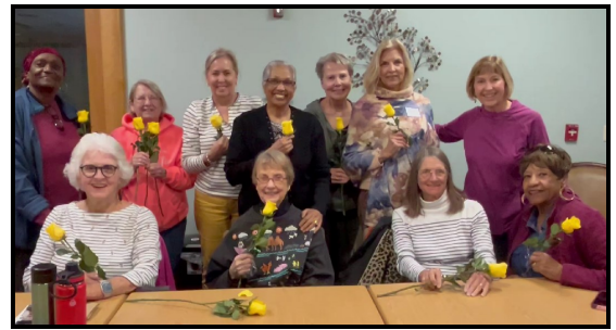
The 3rd Tuesday Hannah Group met in October.