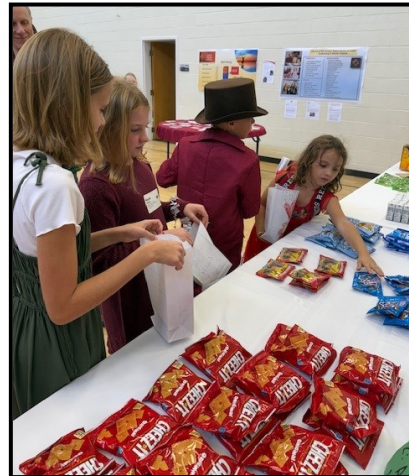
The Moms & Kids group made up snack bags for Wesley Chapel Mission Center on UWF Sunday in October.